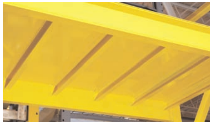
Solid sheet metal decks supported by 2" x 2" tubing to meet capacity requirements