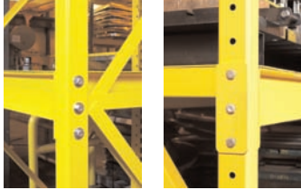
Position drilled 3" adjustability

Steel King Die Storage Racks are designed to meet the most demanding requirements. Standard die storage racks feature: