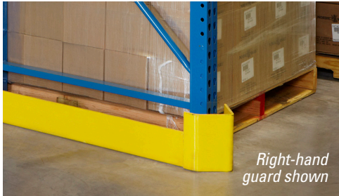
Right-hand guard shown