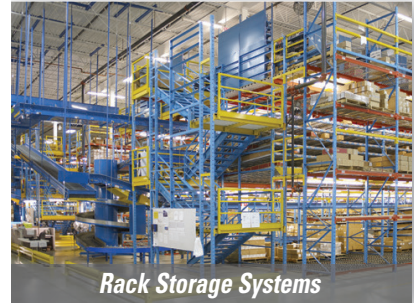
Rack Storage Systems