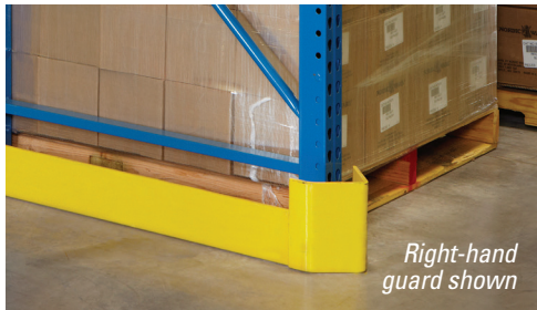
Right-hand guard shown

The Column Core reinforcement is shown in yellow for added emphasis and detail. Actual item is welded into the rack column before painting.